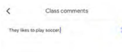
Figure 1. Example of Grammarly mobile keyboard auto-correction feature.