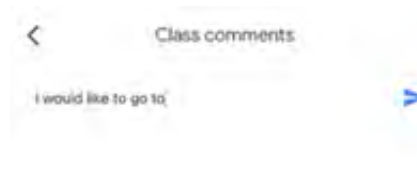
Figure 2. Example of Grammarly mobile keyboard predictive text feature.